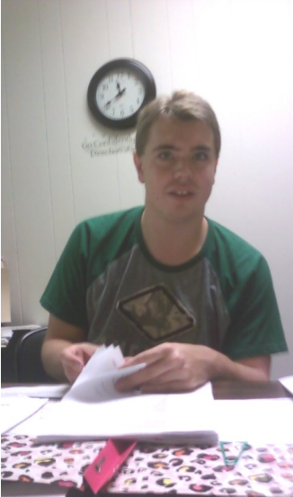
"I love to Organize"